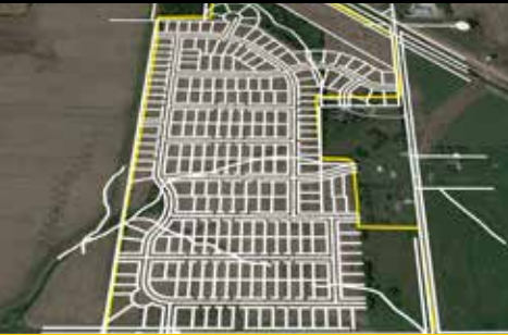
Development Concept Map